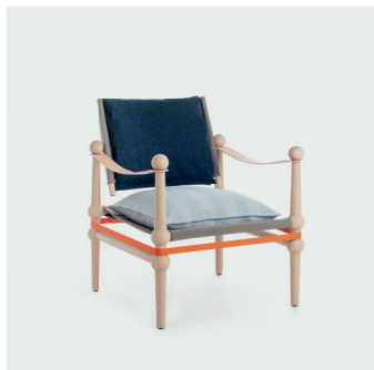
Natural / Light blue