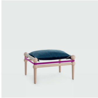
Natural / Light blue