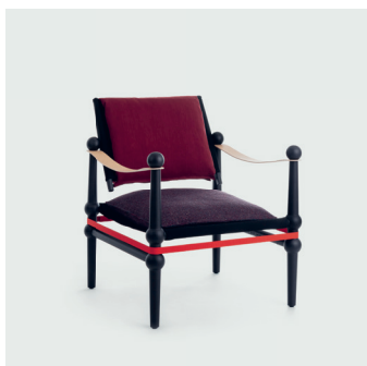
Black / Bordeaux