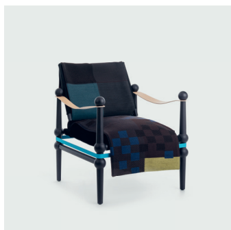
Black / Hella B