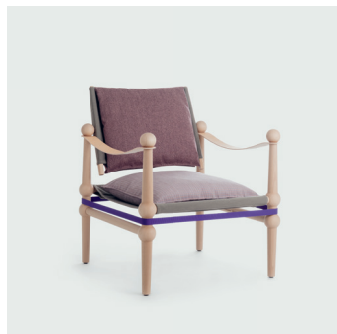
Natural / Pink