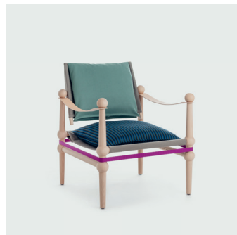
Natural / Sage