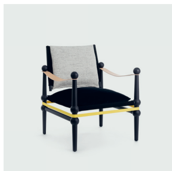
Black / Black & White