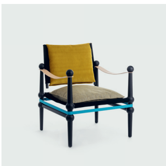
Black / Yellow