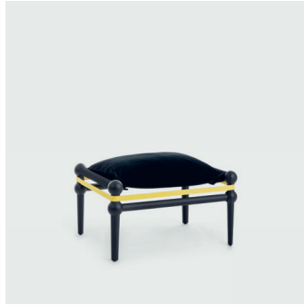
Black / Bordeaux