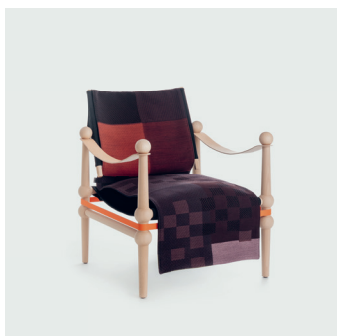
Natural / Hella A